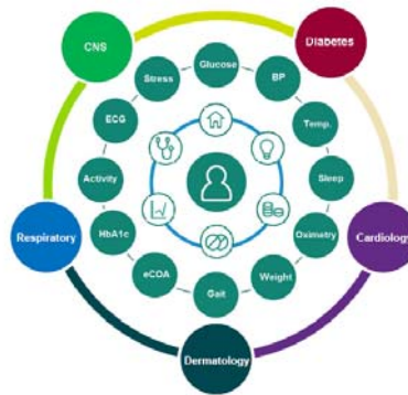
Figure 1: A suite of wearables and sensors can be combined and deployed in a non-clinical home setting, tailored to specific therapeutic areas.

Sensor Suite Proof of Concept : Commercially available devices and sensors were deployed to healthy volunteers located in non-clinical settings in 3 different countries. A suite of wearables and sensors can be combined and deployed in a non-clinical home setting, tailored to specific therapeutic areas (Figure 1).