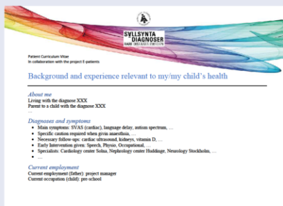
Figure 4: Template patient CV to compile individual collaboration with healthcare professionals in our project "Let's do this together".