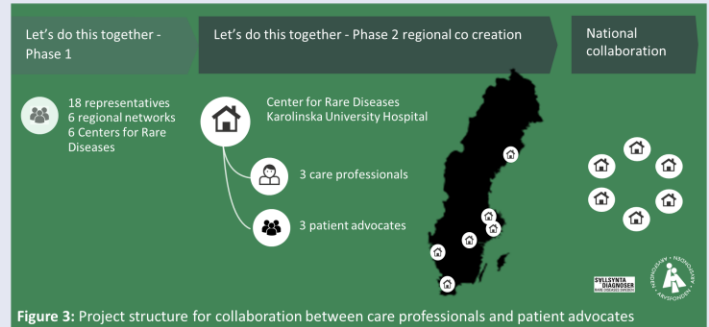
Figure 3: Project structure for collaboration between care professionals and patient advocates