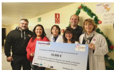
The human face of research