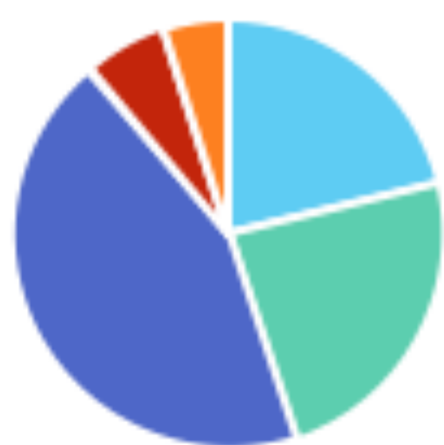
Information Given at Time of Diagnosis (n, 80)

■ Lots ■ Adequate ■ Little ■ None ■ N/A [currently undiagnosed]