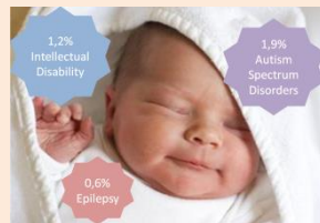
Fig. 1. Percentage of US children with ASD, ID and epilepsy

Genetics play a relevant role in all three presentations, studies show. SCN2A mutations are becoming more and more relevant in the recent years, with these three phenotypes being the most observed in the SCN2A population.